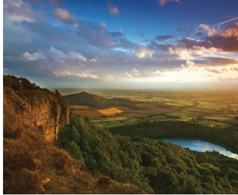
Sutton Bank, North Yorkshire.

Also launching as part of the Festival is the China Business Club. Relationships between China and the Leeds City Region have been growing for many years and the China Business Club will further strengthen these ties and promote future trading and investment. Leeds Retail Innovation Summit will build on the