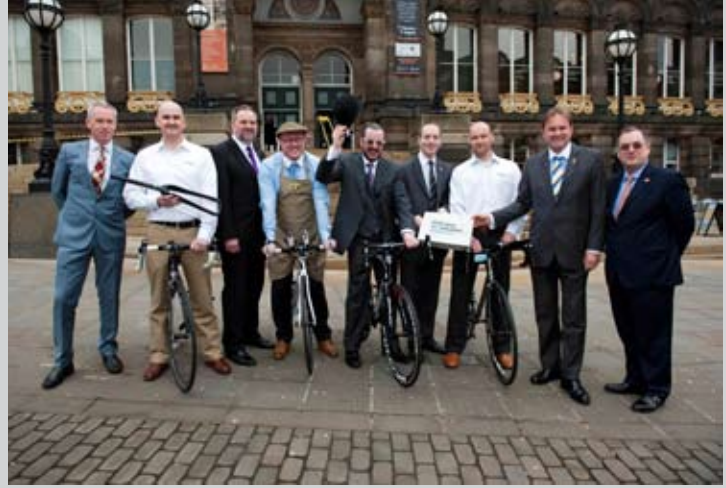
Festival partners and exporters from our April 4th Grand Départ launch in Leeds, with Lord Livingston - Minister of State for Trade and Investment

The world's greatest cycle race - the Tour de France - will start in Yorkshire on 5 th and 6 th July 2014.